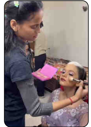
MakeUp on Models by our students

SKILL TRAINING: Tailoring, ISL, English, Computers, Handicraft Making, Beautician