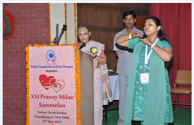
Delhi Foundation of Deaf Women organizes XXI Pranay Milan Sammelan Vishwa Yuvak Kendra Chanakyaपुरi, New Delhi 25 th May 2013