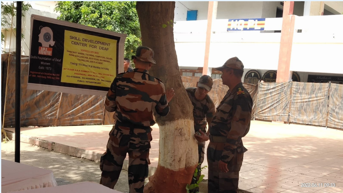
Army Personnels helping us to set up the stalls