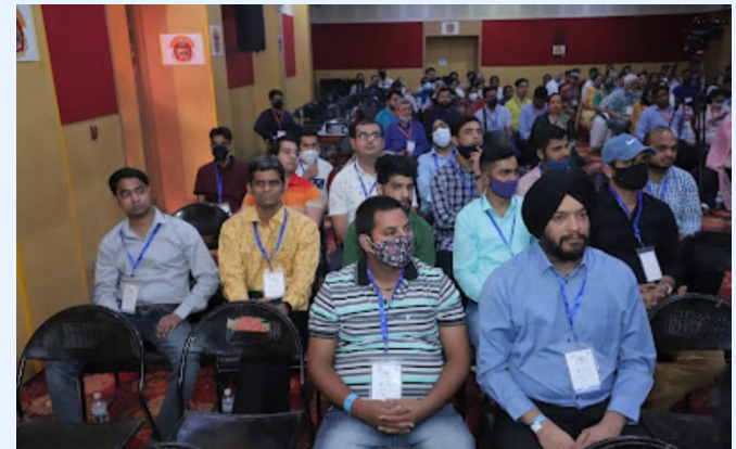
Deaf Girls and Boys Participants at PMS