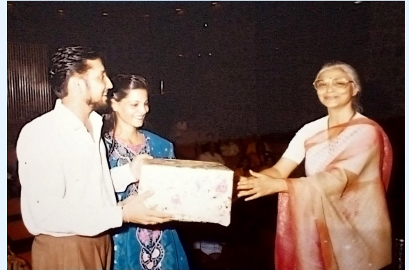
First couple who got married through Pranay Milan Sammelan in 1991

In 2014 this special Parichay Sammelan got affiliated to All India Foundation of Deaf Women and now the sammelan was conducted twice a year.