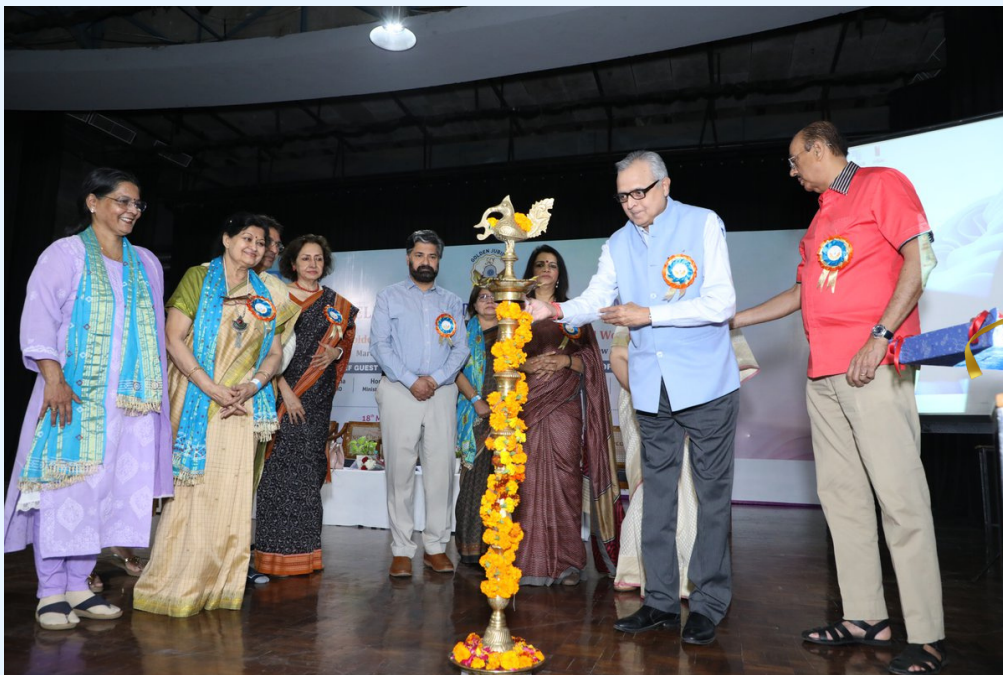
Honorable Chief Guest and Guest of Honor Inaugurating the Event