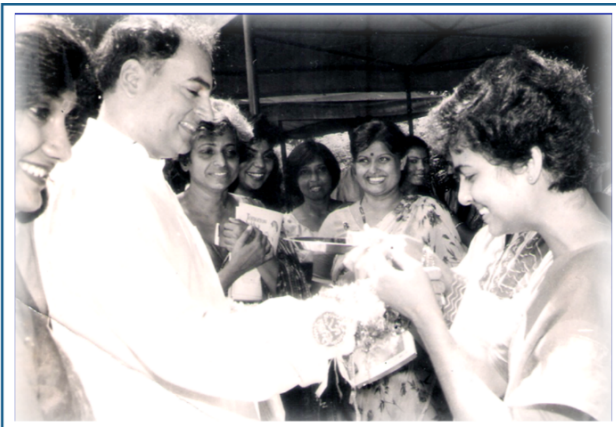
DFDW's deaf member tying Rakhi on the wrist of the then Prime Minister Late Sh. Rajiv Gandhi while Mrs Shobhana Bhartia the then President of DFDW ( left) and other members look on. On his and other Benefactors' Blessings the DFDW flourished in many folds.