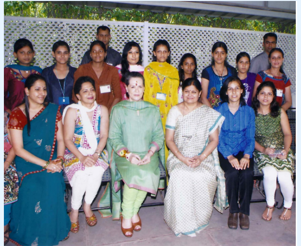
Hon'ble Smt Sonia Gandhiji invited Members and Deaf Students of Delhi Foundation of Deaf Women on occasion of Raksha Bandhan on 28.2012, and felicitated us for the noble mission we are carrying on.