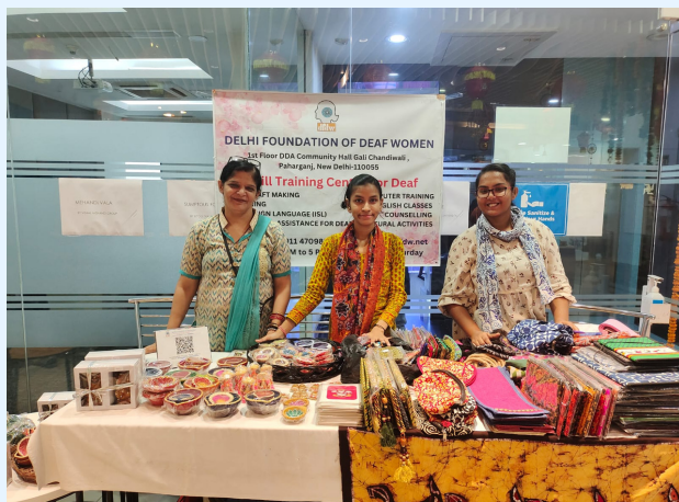
Hand Painted Diyas/ Exhibition

Diwali time is the exhibition time. We participate in various Diwali Melas at Colleges, MNC's, Residential Societies, Community Programs etc. This year also we got chance to participate in Blind Relief Diwali Mela, Colleges Diwali Fate, Hilton Hotel, Surya Hotel, at Malls, Few MNC's at Nodia and Gurugram also invited us.