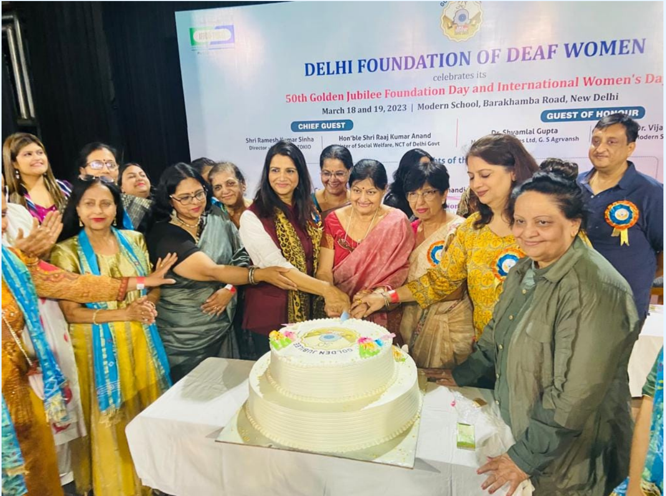
Last but not the Least- Closing Ceremony and Cake Cutting